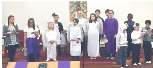
The Children & Youth perform "What I Like Most About Christmas" on Dec. 18, 2016